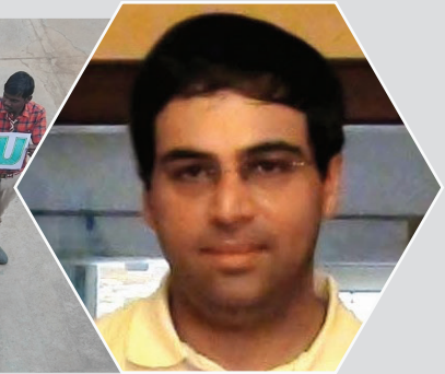
VISWANATHAN ANAND, WORLD CHESS CHAMPION & SUPPORTER

"Swiss Emmaus India needs our help to extend their work. I have done it and so can you. Let us support them together."